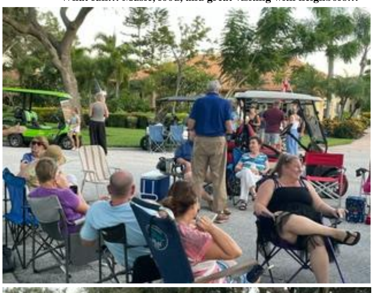
Serenoa Block Party – October 14, 2023 What fun!!! Music, food, and great visiting with neighbors!!!